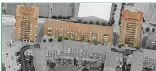
Figure 2. View of the Cuatro de Marzo .

Currently TRL6 (platform prototype demonstration in relevant environment) has been demonstrated for 3 already existing/performed district retrofitting plans: Cuatro de Marzo district in Valladolid (Spain), Mogel district in Eibar (Spain) and Polhem district in Lund (Sweden). The purpose of this TRL is to demonstrate the platform prototype on real districts. In this case is of particular importance to validate that the platform fulfils its technical requirements (correct calculations, relevant calculation time, useful Graphical User Interfaces, etc.) and answers end-user needs (provide relevant and useful information in a time efficient process). All this information obtained from the platform is later compared with the existing and available information of the real retrofitting plans in order to fine-tune the OptEEmAL prototype.