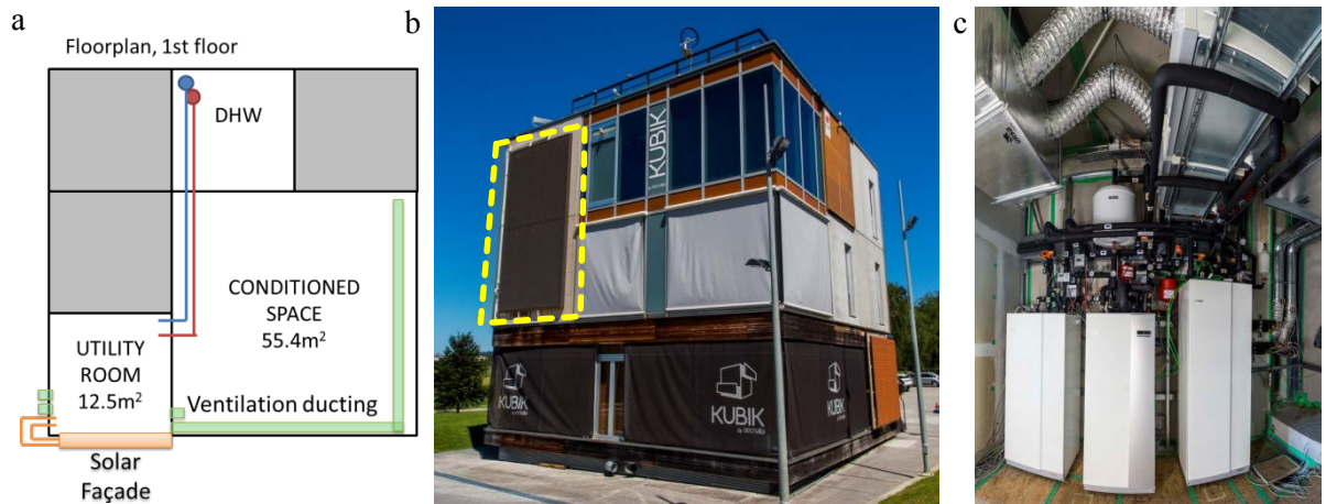
Fig. 3. (a) Floor plan of the Kubik building with the area for tests; (b) South façade of the Kubik building highlighting the solar façade; (c) Utility room with installed equipment.

For the case in Kubik as in a real retrofitting work, the available surface was also limited. The resulting disposition of the system is described in Figures 3 (a), (b) and (c). For the external solar façade 18 m 2 of south-oriented active panels were installed (21.29 m 2 if lateral trims are considered as marked in Figure 3 (b)). The support was the existing prefabricated concrete wall. For the internal space to be acclimatized a total surface of 67.9m 2 was arranged (Figure 3 (a)). Part of this total area, 12.4m 2 , was required for the utility room, which is also directly connected to the conditioned space and contributes to the volume of air to be heated. Figure 3 (c) shows the final disposition of the utility room with the heat pump placed in the middle, the solar storage tank on the right side and the DHW storage tank on the left side, following the scheme represented in Figure 2 (b).